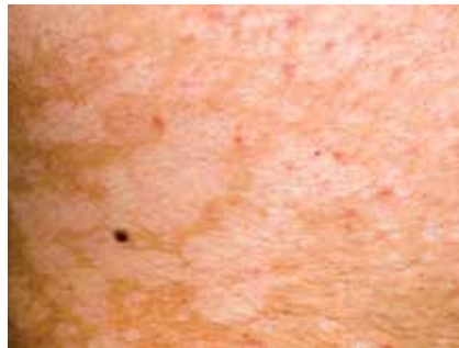
Figure 13. Pityriasis versicolor.

Seborrhoeic dermatitis presents as a pale pink, ill-defined erythematous rash characterised by loose, flaky scale. Dandruff is seborrhoeic dermatitis on the scalp. The mid face, along the eyebrows, nasolabial folds, and cheeks and beard areas are classically affected. The rash may also be present on the central chest, upper back and in the axillae (Figure 12). Seborrhoeic dermatitis is more common in people who are psychologically stressed, fatigued or in poor general health. HIV infection and other immunodeficiencies are a common association, as are Parkinson's disease, stroke and other neurological diseases.