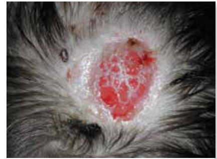
Figure 3. Extensive inflammatory scarring and resultant hair loss around a kerion of the scalp.

Fungal folliculitis, extensive tinea corporis, tinea incognito, kerion or any other atypical fungal infection should be treated additionally with an oral antifungal agent. Treatment should continue until clinical cure is achieved. Oral terbinafine is highly effective (250 mg daily for at least two to four weeks until the rash settles). It is not on the Pharmaceutical Benefits Scheme for this indication, but generics are available that make it a viable option. Fluconazole 150 to 200 mg weekly for up to four weeks is therapeutic and economical (off-label use). Itraconazole 200 mg twice daily for one week per month is an alternative, but the cost in Australia is prohibitive. Oral griseofulvin 500 mg daily is a traditional treatment, but less efficacious than other agents. With any prolonged oral therapy, liver function tests may be appropriate every six weeks or so to exclude hepatotoxicity.