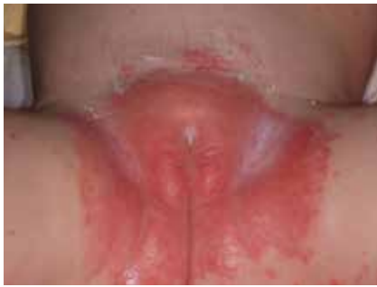
Figure 4. Candidiasis in the inguinal region. Note the satellite lesions away from the main infection.