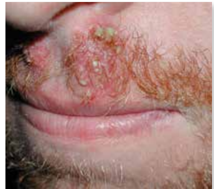
Figure 8. Kerion of the moustache area.

suspected, a history of possible exposure needs to be explored