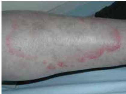
Figure 1. Tinea corporis on a leg. Note the active, advancing border, central clearing and scale. Skin scrapings should be performed from the edges.

of ergosterol synthesis. It is available as an over-the-counter lacquer paint formulation for the treatment of onychomycosis caused by dermatophytes and yeasts. Although early clinical trials showed some benefit, it is relatively expensive, has variable effectiveness and is unlikely to be useful for extensive, deep onychomycosis; systemic agents are best used for these infections.