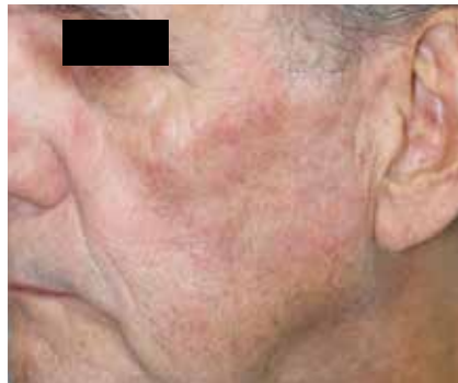
Figure 7. Tinea incognito. Treatment of tinea faciei with topical corticosteroid has obscured its classic features.

Tinea faciei often presents in an annular pattern similar to tinea corporis (Figure 6). However, topical corticosteroids are often prescribed initially, leading to tinea incognito (Figure 7). Solar exposure can worsen the inflammation. As mentioned earlier, pets may be the source of facial tinea, and the possibility that a new pet is the source of fungus should be explored. Although much less commonly recognised than tinea elsewhere, the clinical features of an annular rash with an active border should