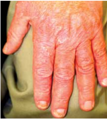
Figure 9. Tinea manuum. Note the scaly, serpiginous superior border just above the metacarpophalangeal joints. Diagnosis is made difficult due to prior topical corticosteroid use.