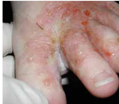
Figure 10. Interdigital tinea pedis. Note the white, boggy macerated skin in the depth of the fold, and the associated inflammatory tinea pedis on the adjacent skin.

Skin scrapings, fungal microscopy and culture is key to a diagnosis. Topical antifungal agents can be used for small areas. However, given that tinea manuum can be extensive and commonly coexist with other areas of dermatophyte infection, an oral