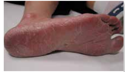
Figure 11. Moccasin tinea pedis. Note the dry scaly fissured infected skin involving the entire sole.