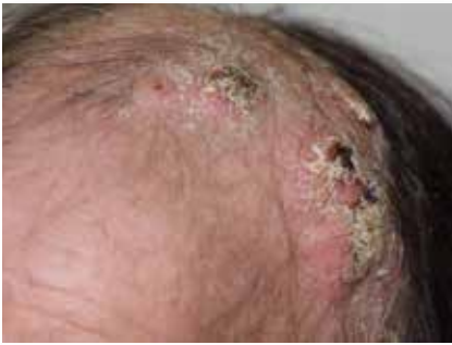
Figure 2. Kerion of the scalp.