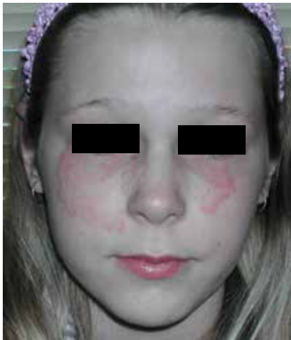
Figure 6. Tinea faciei. The source of the infection was a new kitten.

the depths of the folds, although not always. Co-infection with Candida or the incidental presence of a dermatophyte should always be considered.