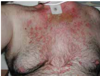
Figure 12. Seborrhoeic dermatitis.

lotions/sprays (e.g. terbinafine spray-on lotion, econazole spray-on lotion or miconazole tincture) should be used as they dry on the skin, whereas cream-based products may encourage more maceration and wetness. If there is excessive inflammation, a topical antifungal can be used in conjunction with a topical corticosteroid lotion, such as mometasone furoate 0.1% drops.